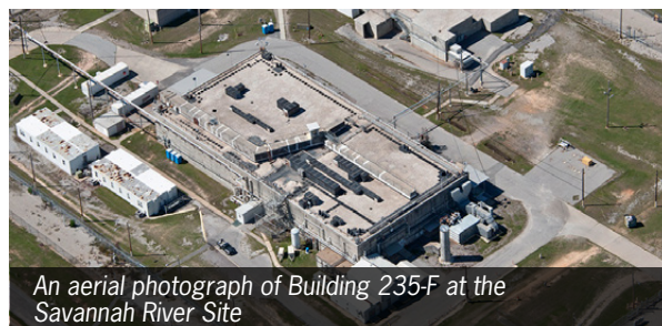
An aerial photograph of Building 235-F at the Savannah River Site

Long-term, deep-space missions — such as Galileo, Ulysses, and Cassini — used SRS Pu-238 to generate electrical power needed to operate the instruments on board the spacecraft, such as operating cameras, collecting data and relaying information to the earth.