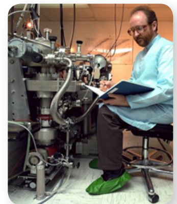
Trace radionuclide isotopic analysis by mass spectrometry

NNSA Defense Nuclear Nonproliferation R&D (NA 22) is the principal federal sponsor of long-term nuclear nonproliferation- related R&D.