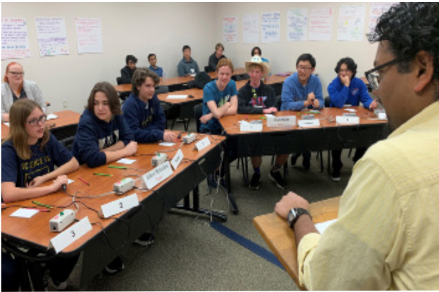
DOE Science Bowl teams from Aiken Scholars Academy in Aiken, South Carolina, foreground, and Riverside High School, Greer, South Carolina, practice “buzzing in” to answer questions before another round of competition during the regional competition sponsored by DOE’s Savannah River Site.