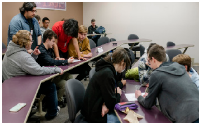
Three DOE Science Bowl teams compete during a brain teaser activity to earn prizes for their teachers. Five team members from North Augusta High School in North Augusta, South Carolina, left, strive to win the round while members of Dorman High School in Spartanburg, South Carolina, right, race to defeat them.

Each Science Bowl team consist of four students, an alternate and a teacher who serves as an advisor and coach. This year's regional contest involved 95 students from 13 high schools and is the only academic competition of its kind that tests students’ knowledge in all areas of science and is sponsored by a federal agency.