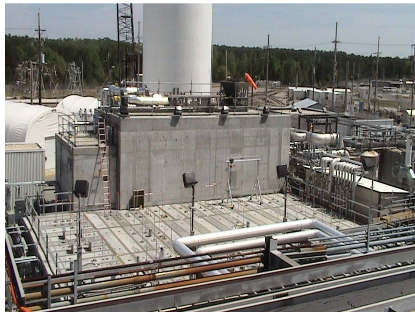
Modular Caustic Solvent Extraction Unit (MCU)