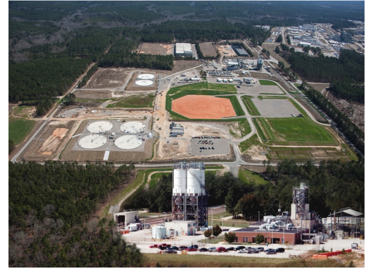
Saltstone Disposal Unit 6