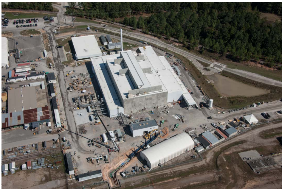
Salt Waste Processing Facility (SWPF) Project