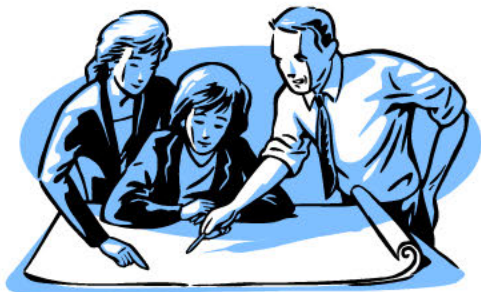
Planning & Execution