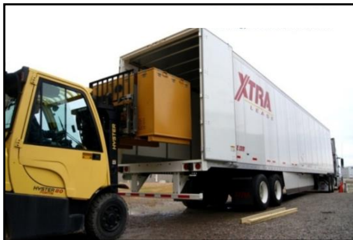
Mixed Waste Shipment to Utah