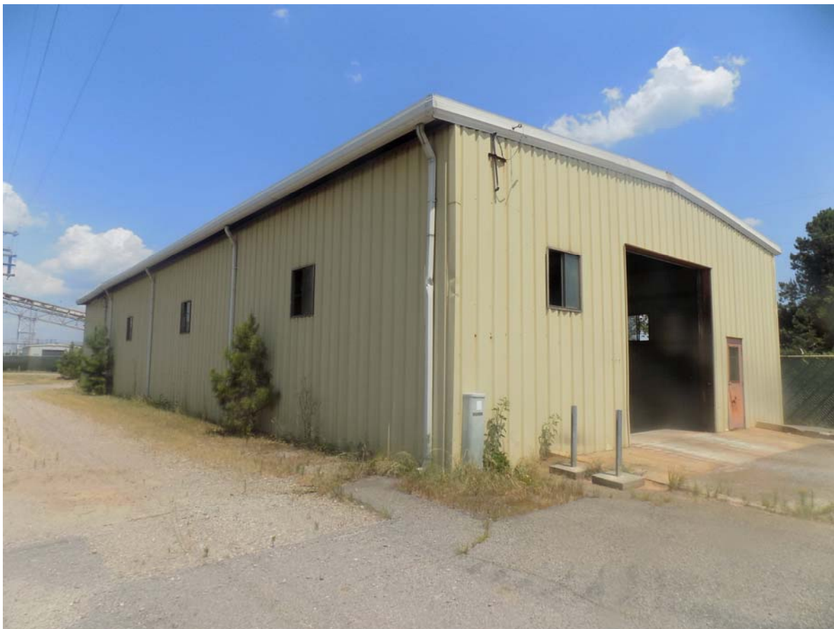
Figure 1. Building 484-13D, D-Area Storage Building and 80-22D, Bone Yard Storage

The Bone Yard Storage, 80-22D (Figures 1, 4, and 5), is enclosed by a fence that surrounds the area. The approximate dimensions of the laydown area are 68 ft by 430 ft. The Bone Yard was used for miscellaneous storage. The Bone Yard appears to have been placed into service after 1973. Buried within the Bone Yard are process lines for domestic water and service raw water.