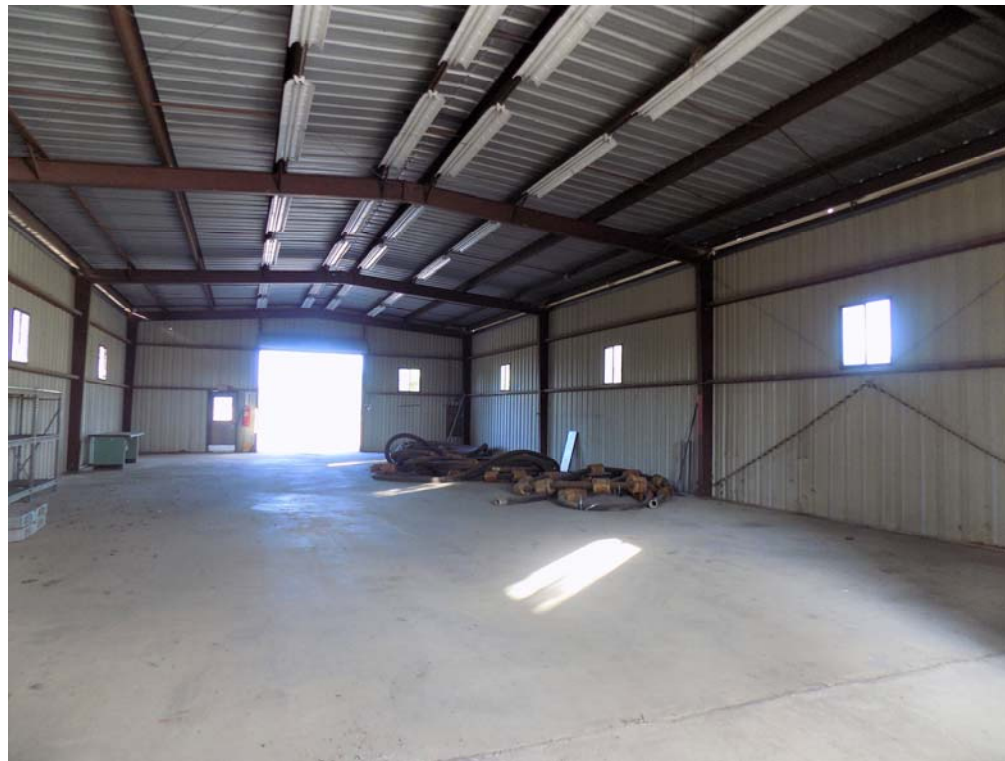
Figure 3. Building 484-13D Interior