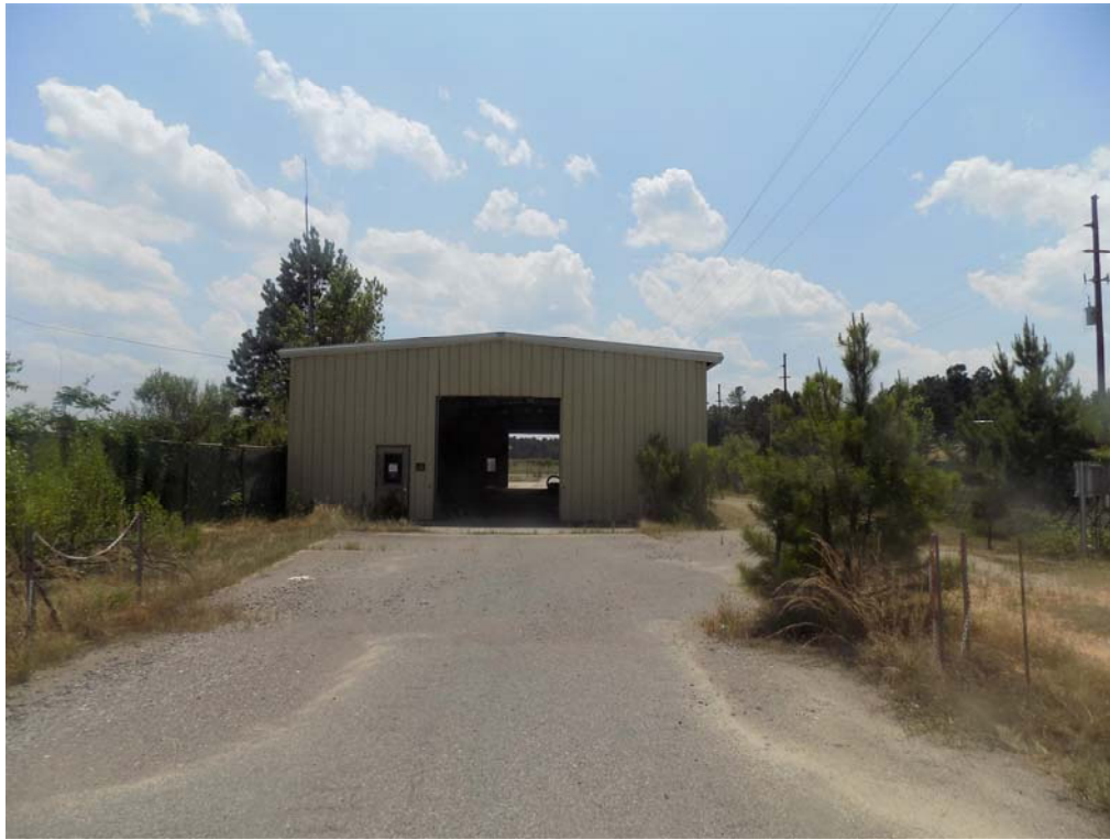
Figure 2. Building 484-13D, D-Area Storage Building