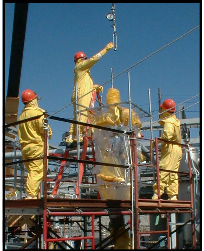
SRS employees conduct work in one of the site’s tank farms.

SRS has successfully conducted this space reclamation operation in the tank farms since 1960, when the first evaporator facilities began operation. Without these evaporator systems, SRS would have required 86 additional waste storage tanks—at about $50 million apiece—to store waste produced over the site’s lifetime.