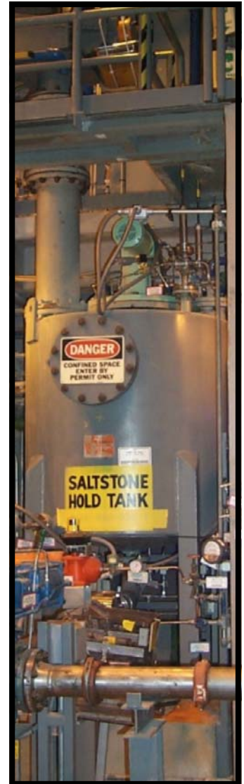
The new Saltstone hold tank, one of many modifications made in 2003 so the facility is ready to process low-curie salt when other modifications are complete.

The washed and decanted sludge is transferred to DWPF as part of "sludge only" operations. DWPF then processes the sludge from the original waste by combining it with glass frit. The mixture is heated until it melts, then is poured into stainless steel canisters to cool. The