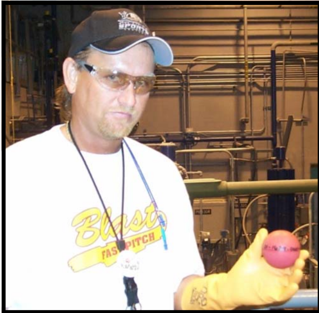
A Saltstone employee shows a "pig," which is used in facility operations.

glass-like solid that forms contains the highly radioactive material and seals it off from the environment. Another word for this process is "vitrification." The sealed canisters will be stored at SRS until a federal repository is established.