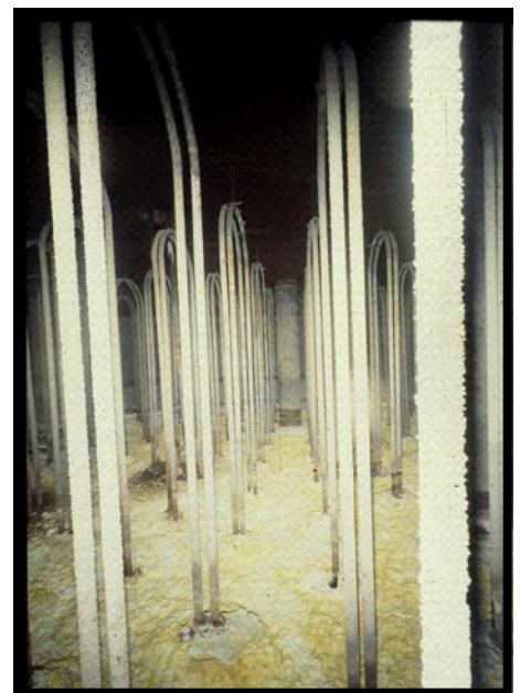
A close-up view of sludge inside one of the waste tanks.