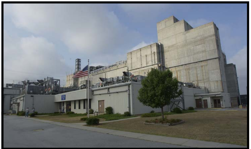
DWPF is the world leader in converting radioactive waste into glass.