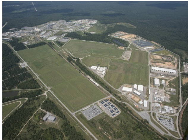
E-Area Waste Storage and Disposal Facilities

You will find more information in the Radioactive Liquid Waste: Operational Tank Closure and Liquid Waste Facilities fact sheets on SRS's website.