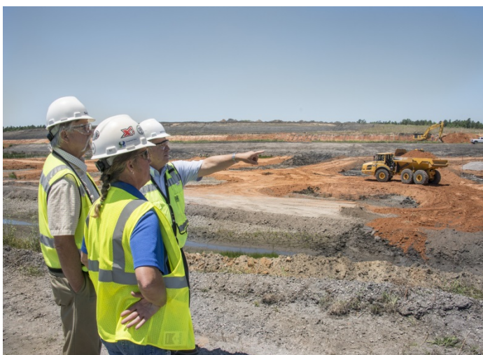
SRS Employees Observe D-Area Coal Ash Basin Closure Activities

Past operations at SRS have resulted in the release of hazardous and radioactive substances to soil which subsequently have ended up in the groundwater. The Area Completion Projects is responsible for and focuses on reducing the footprint of legacy waste at SRS's contaminated waste sites and obsolete facilities. Area Completion Projects cleans up contamination in the environment by treating or immobilizing the source of the contamination; mitigating transport through soil and groundwater or slowing the movement of contamination that has already migrated from the source. Cleanup actions include capping inactive waste sites, installing and operating efficient groundwater treatment units, and using natural remedies, such as bioremediation (using naturally occurring microbes) and natural remediation (using natural processes) to reduce contaminants from reaching groundwater or the contaminants concentrations in groundwater.