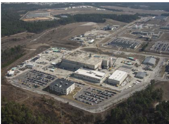
MFFF Facility under Construction