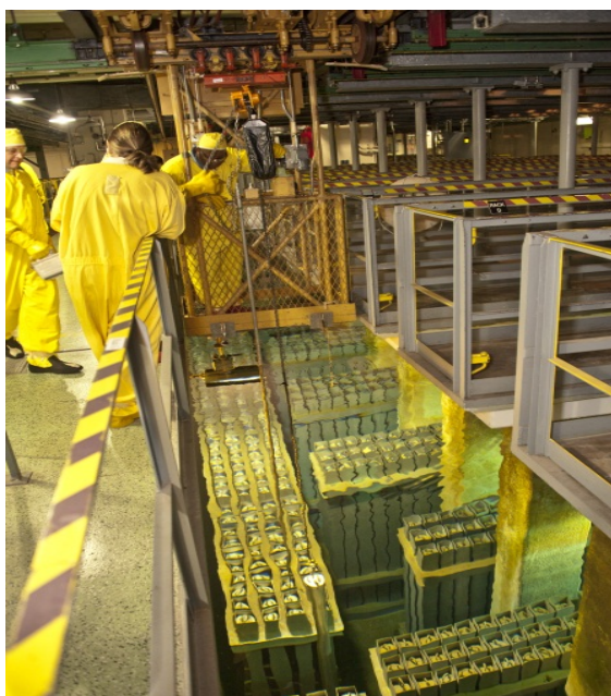
Spent Fuel Storage in the L-Area Complex

You will find more information on the Nuclear Materials Management page on SRS's website.