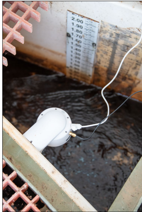
Camera Technology Allows for Remote Connection and Calibration.