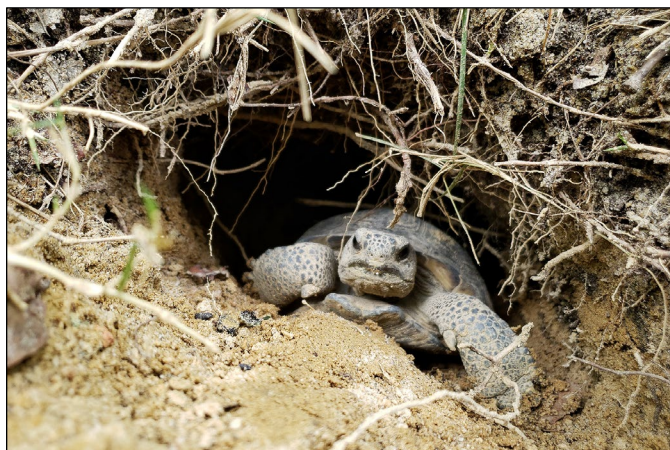
The Gopher Tortoise is One of the Threatened Animal Species at Home on the Savannah River Site.

The Site also provides habitat for state or federally listed as threatened or endangered animal and plant species, including the wood stork, the red-cockaded woodpecker, the gopher tortoise, the pondberry, and the smooth coneflower. These species and SRS's programs that protect their existence are featured in an SRS Environmental Report Summary article that examines conservation efforts on the Savannah River Site.