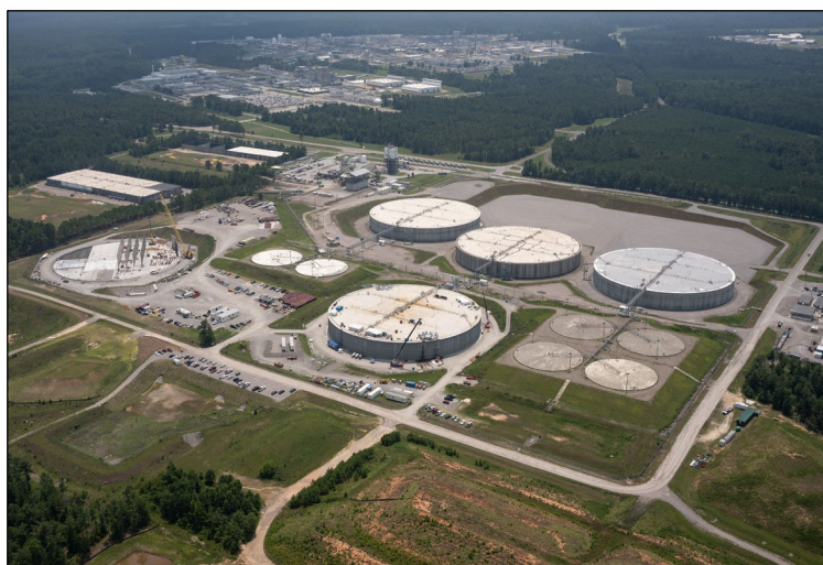
SRS is Constructing the Final SDUs: SDU-10, SDU-11, and SDU-12.

SRS generates radioactive liquid waste as the by-product of processing nuclear materials for national defense, research, and medical programs. The Site safely stores approximately 33 million gallons of radioactive liquid waste underground in the F-Tank Farm and H-Tank Farm in F Area and H Area, respectively. Closing these tanks is a high priority for DOE-EM. To do this, SRS must first remove the waste from the tanks, which is mostly salt waste, and then process and treat the waste before disposing of it.