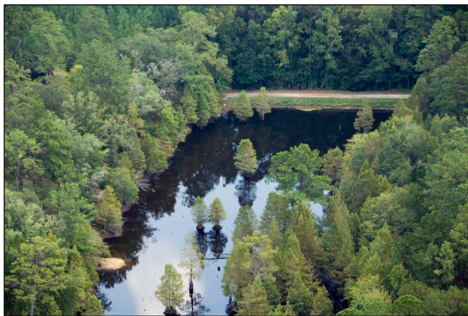
Crackerneck Wildlife Management Area and Ecological Reserve Provides Public Access to Carolina Bays.

About 10% of SRS's land is industrial; the remaining 90% consists of natural and managed forests that the USFS-SR plants, maintains, and harvests. SRS consists of four major forests: 1) mixed-pine hardwoods, 2) sandhills pine savanna, 3) bottomland hardwoods, and 4) swamp floodplain forests. These forests, as well as Carolina bays, are accessible to the public when visiting the Crackerneck Wildlife Management Area and Ecological Reserve near Jackson, South Carolina.