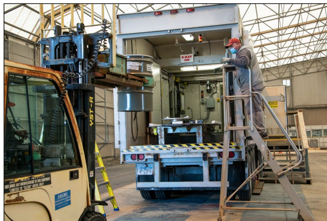
A Real Time Radiography Unit at the Solid Waste Management Facility Can Characterize and Certify TRU Waste Before Shipping to WIPP.

DOE conducts annual reviews to ensure Site operations are within DOE's performance standards. The annual reviews for the E-Area Low-Level Waste Facility Performance Assessment (PA) showed that SRS continued to operate these facilities in a safe and protective manner.