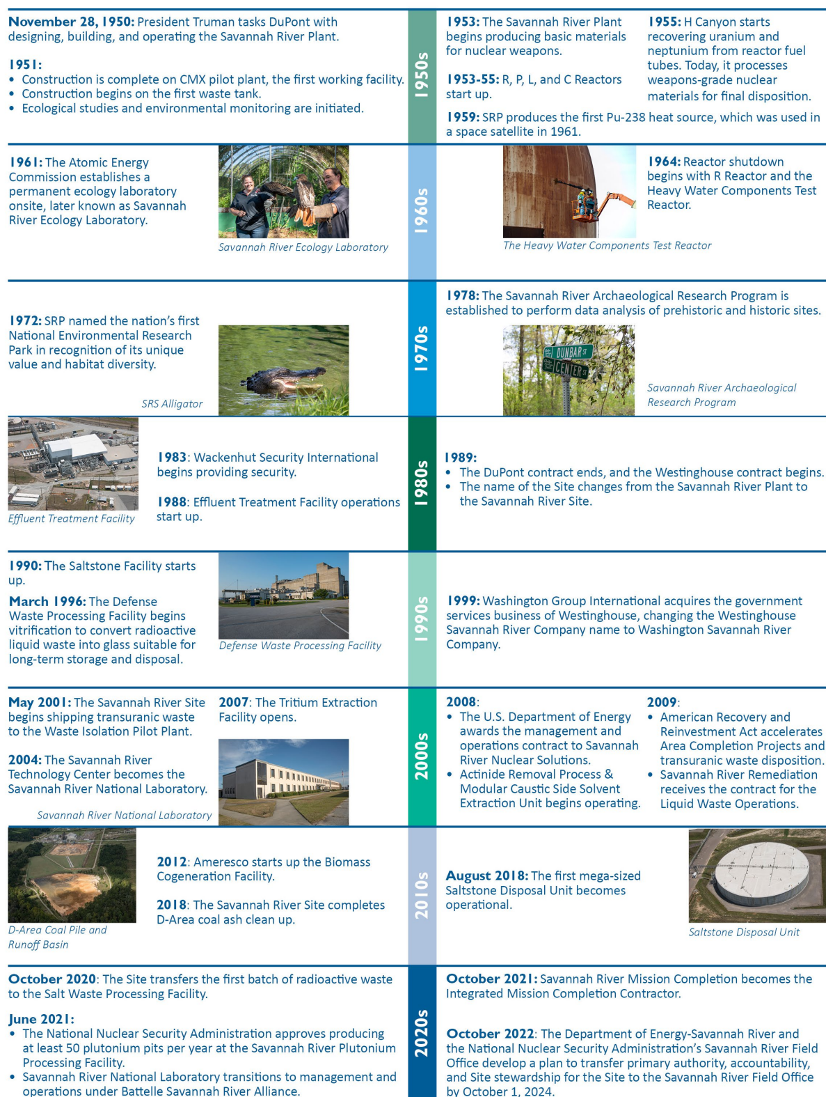
Figure 1-1 Timeline Depicting Key Milestones in SRS History