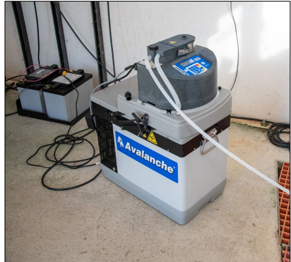
A Refrigerated Sampler Ensures the Preservation of Samples.

SRS uses SCDHEC-certified laboratories for those EMP parameters that are reportable to SCDHEC. SCDHEC certifies the SRS onsite laboratories and offsite subcontract laboratories for a large variety of environmental analyses. In 2023, SCDHEC performed a recertification evaluation of the Central Sanitary Wastewater Treatment Facility Laboratory. These evaluations include a review of QA and QC practices and procedures. SCDHEC renewed the certification for this onsite laboratory for another three years.