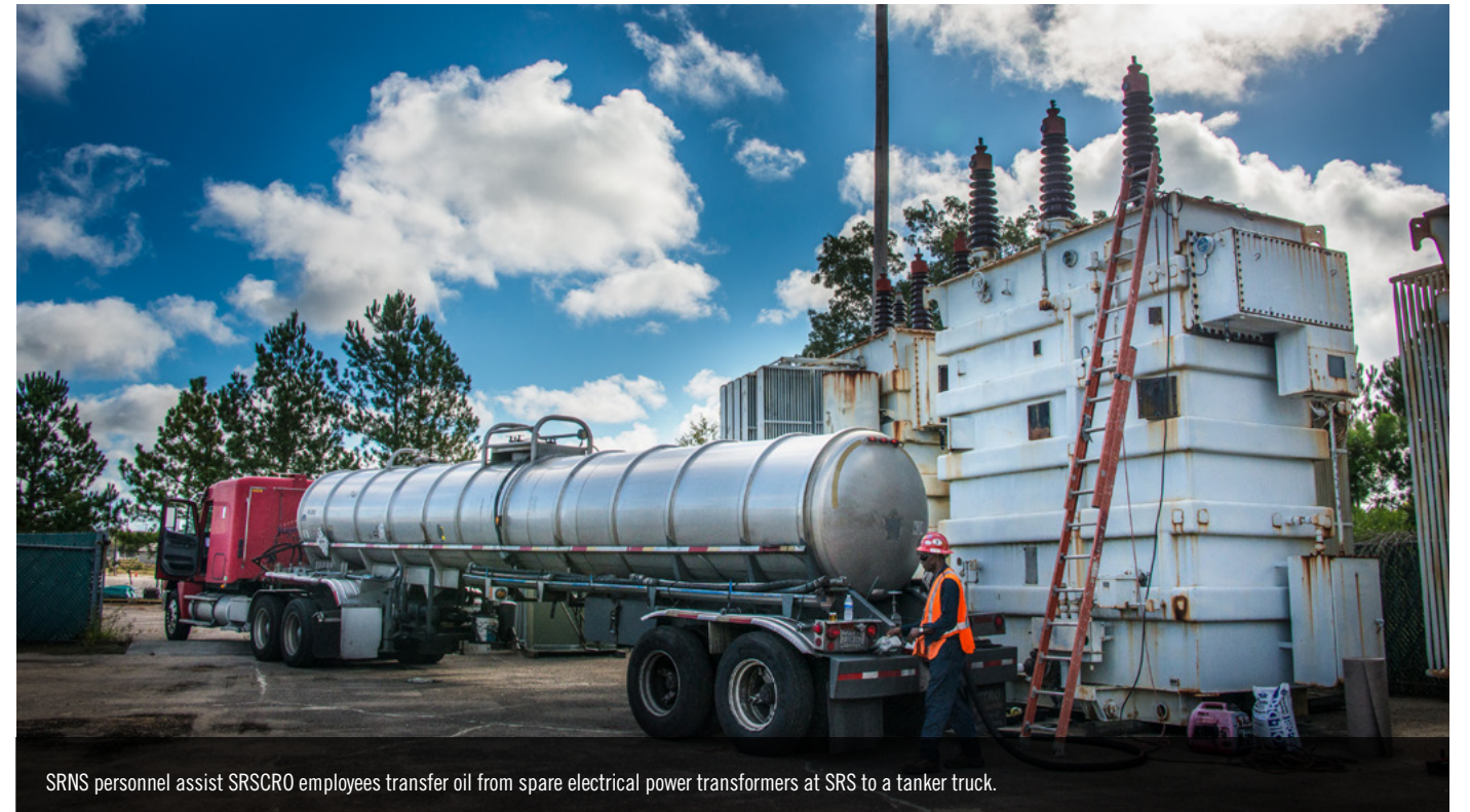
SRNS personnel assist SRSCRO employees transfer oil from spare electrical power transformers at SRS to a tanker truck.