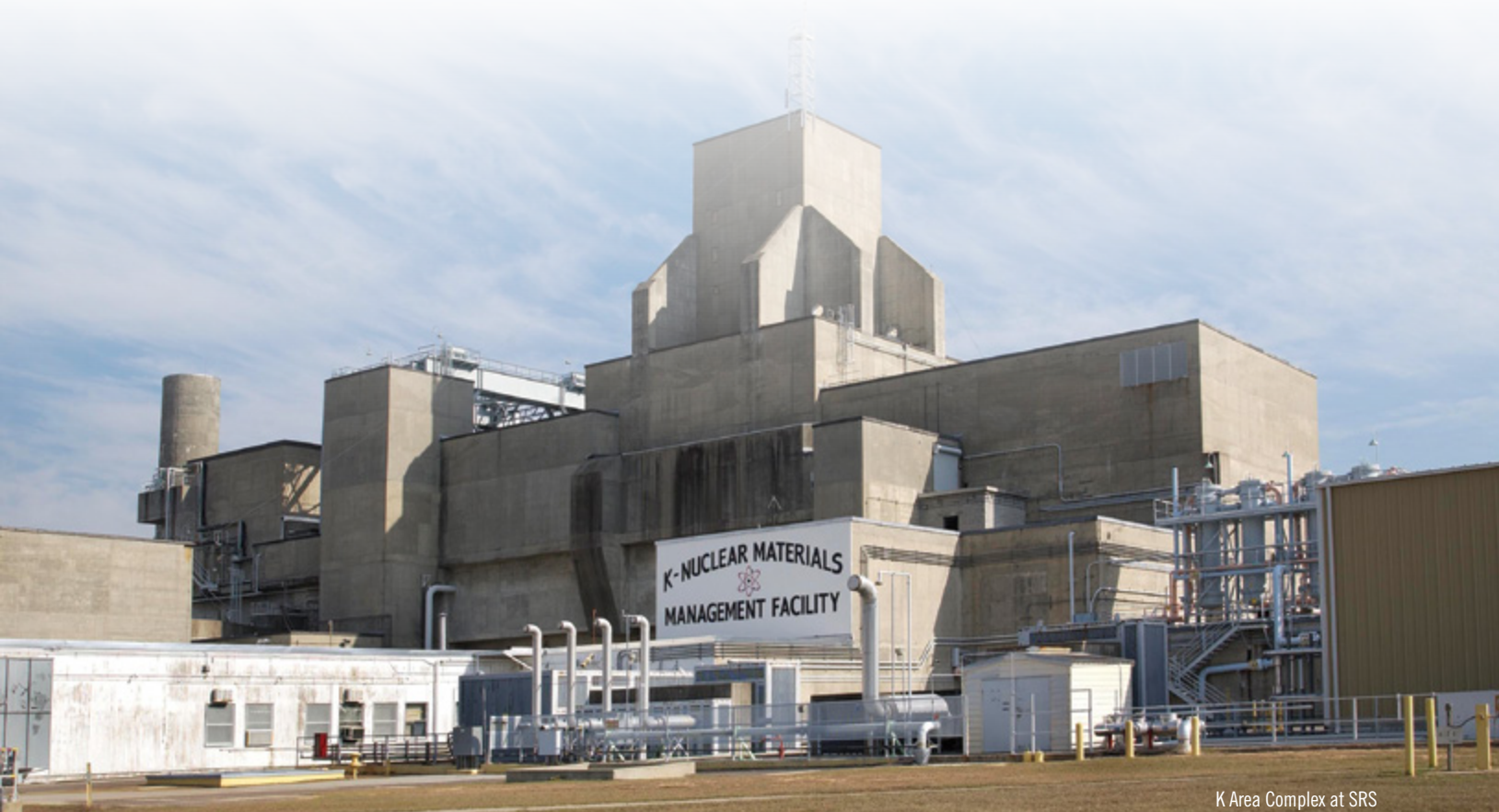
K Area Complex at SRS

Extensive preparations for the startup included a revision of the facility’s safety analysis to reflect the down-blending process, developing operational and safety procedures, training personnel on the down-blending process, and performing a readiness assessment to demonstrate that the facility’s workforce and equipment are prepared to begin down-blending operations.