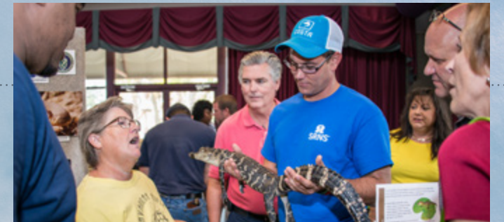
Employees from The Savannah River Ecology Lab gave SRS Safety Expo attendees an opportunity to have a hands-on experience with some of SRS' diverse wildlife.

Countless SRS employees play an active role in making the event a success every year. With roughly 30 Local Safety Improvement Teams or LSITs, hosting booths or providing logistical support to the event, the contributions from the SRS workforce make the expo a memorable experience for all who attend.