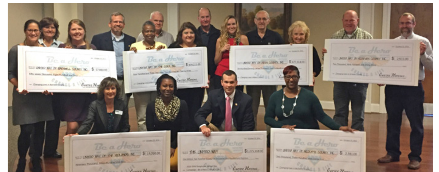
Representatives of the United Way agencies, along with SRNS employees, were on hand for the donation celebration on Oct. 25.

The United Way agencies that receive contributions from the SRNS Employee United Way Campaign include: Aiken County; Allendale County; Barnwell County; Bamberg, Colleton and Hampton Counties; Edgefield County; Midlands; McDuffie County; Screven County; and United Way of the CSRA.