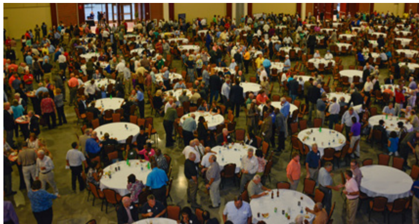
SRNS 25-Year Reception at the Augusta Convention Center.